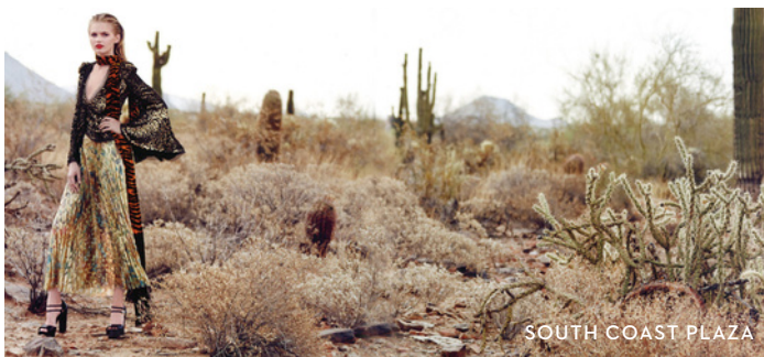
SOUTH COAST PLAZA