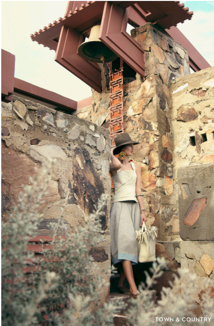
TOWN & COUNTRY