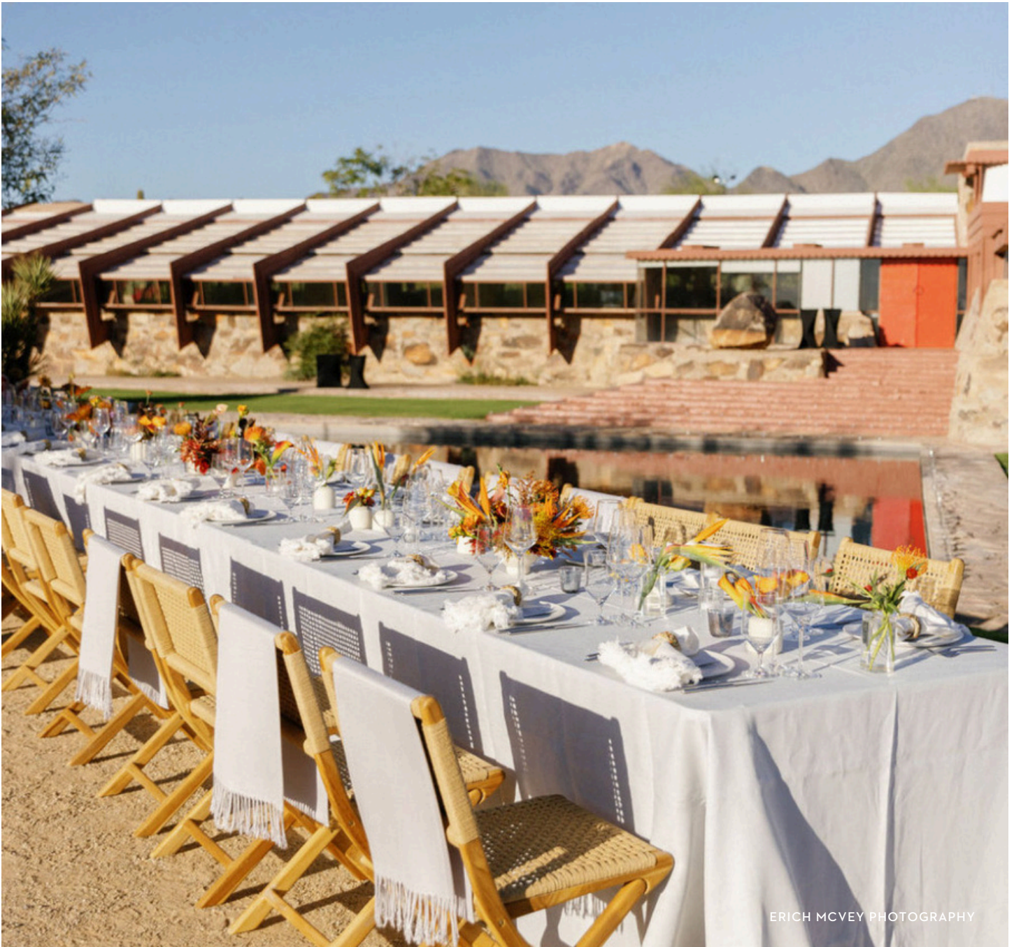
ERICH MCVEY PHOTOGRAPHY