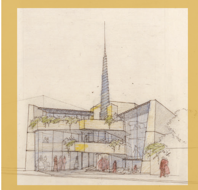
ANDERTON COURT SHOP